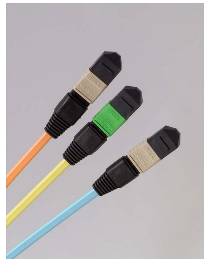
Multimode, Singlemode and 10Gbps cables

Factory terminated fiber optic systems provide the highest quality repeatable connections possible. All MTP system components are 100% optically tested before they leave the factory. Test reports are included with the product. A MTP system is the fastest way to install a fiber optic system.