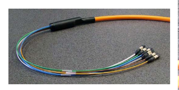
72 fiber cable with 6 x 12 fiber MTP's