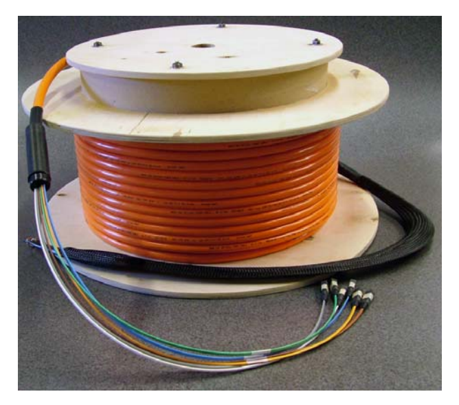
72 fiber MTP premise style cable

Interlocked Armor Cables: For industrial indoor installations requiring extra protection or for mission critical applications.